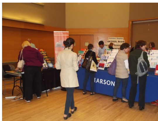
Attendees Enjoying the Publishers' Sessions

ers may be underdeveloped. For example, Haun pointed out, Writing Centers are often over-utilized by ELL students; at the same time the support these centers offer may not meet the needs of the ELL learners. In addition, the survey showed that students tend to avoid program models that label them as different or deficient. They avoid standard ELL classes because they believe these classes will separate them from their peers. These findings suggest that more work is needed to develop services that authentically support student success.