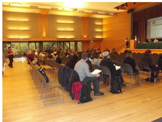
Fall Conference attendees fill the ballroom at PSU

The survey helped the IELP at PSU identify several areas of challenge for ELL students, including financial challenges, transition and cultural challenges, academic English proficiency challenges, and challenges related to the accessibility of resources that support success. The survey also suggests that traditional systems in place for preemptively identifying students in need of support at the postsecondary level may be inadequate, and that the systems in place for supporting students once they are identified as English Language Learn-