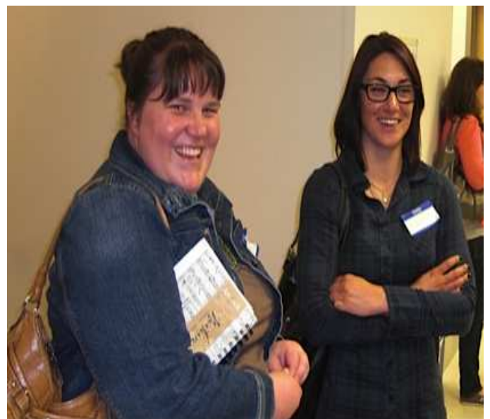
ORTESOL Participants Enjoying Themselves

Thank you for your participation and support, and for making our Spring Workshop a success!